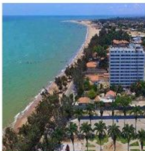
Partial view of the city of Benguela, Angola

She was also Deputy Permanent Representative of Portugal to the United Nations Environment Programme (UNEP) and the United Nations Human Settlements Programme (UN-HABITAT) in the same country, among other responsibilities in the Portuguese Ministry of Foreign Affairs.