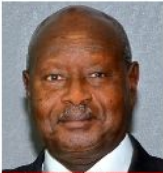
H.E. Yoweri Kaguta Museveni President of the Republic of Uganda