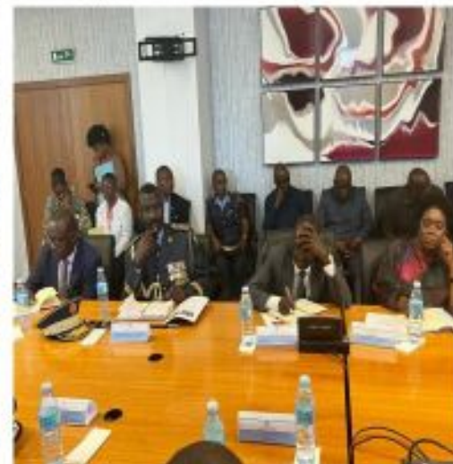
71 | DIPLONEWS