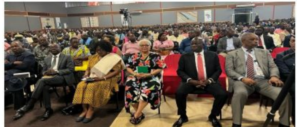
81 | DIPLONEWS

As a state that fully subscribes to the sacrosanct principle of respect for the territorial integrity of other states, the Namibian government's position is categorically clear, as it does not tolerate the behaviour that Namibians have adopted in relation to non-compliance with the laws of the Republic of Angola, she clarified.