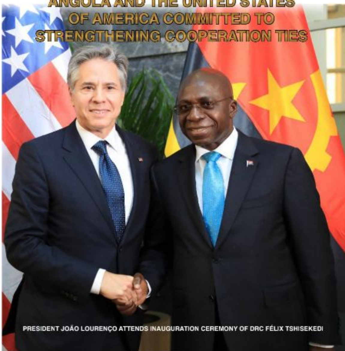
PRESIDENT JOÃO LOURENÇO ATTENDS INAUGURATION CEREMONY OF DRC FÉLIX TSHISEKEDI