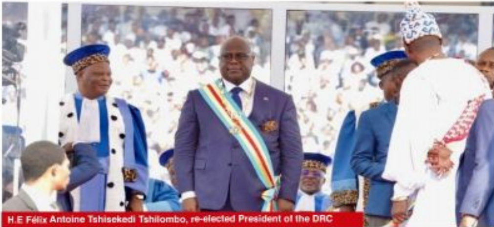
H.E Félix Antoine Tshisekedi Tshilombo, re-elected President of the DRC