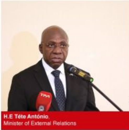
H.E. Tété António Minister of External Relations

Improving working and social conditions, training human resources and rationalising resources and financial assets are some of the main management challenges for 2024 at the Ministry of External Relations.